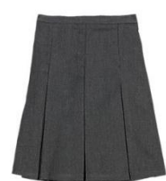
Knee Length Skirt