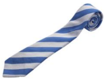
Tie (KS1 on elastic)