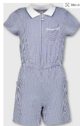
Navy Gingham Playsuit