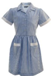
Navy Gingham Dress