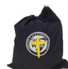
PE Bag (optional)