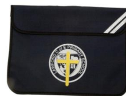
Book Bag (optional)