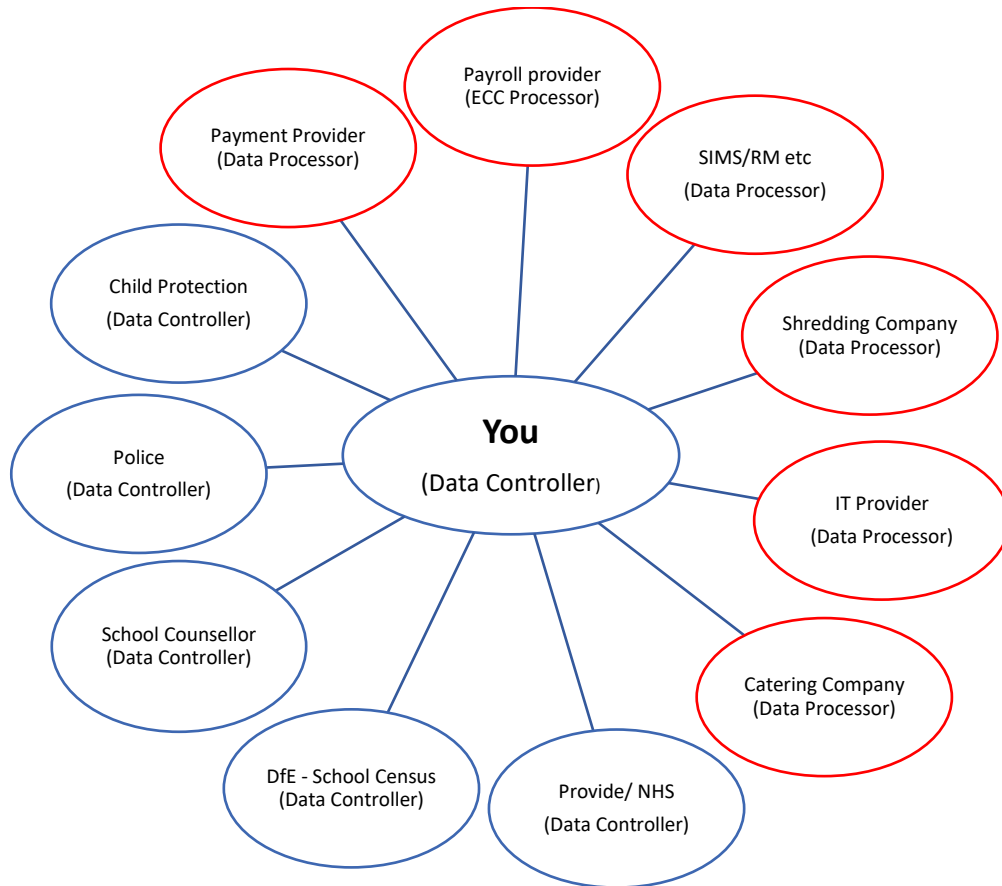
Diagram showing examples of Data Processors a school may work with (Red), and where they may work with other Data Controllers (Blue).